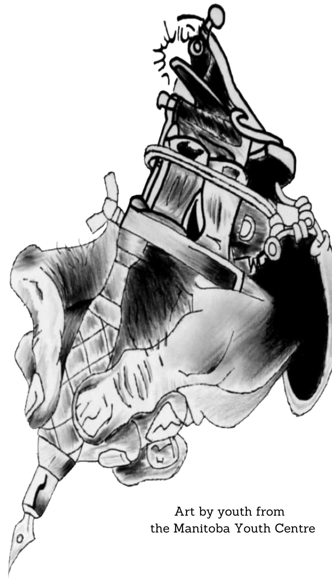
Art by youth from the Manitoba Youth Centre